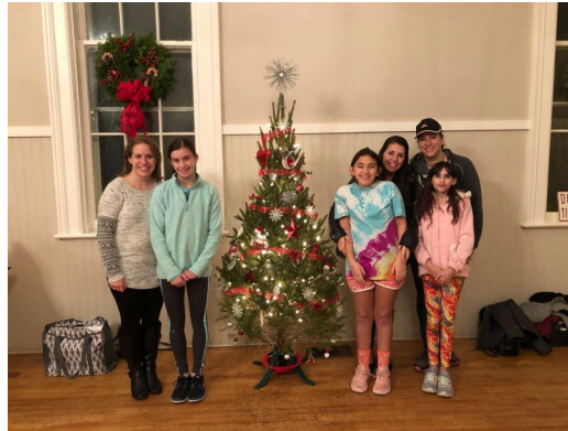
HMS Stage Booster Club