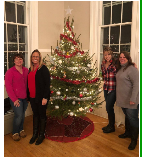
Local Prevention Council