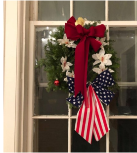
Cub Scout Pack 82