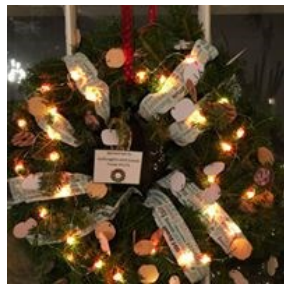
Girl Scout Troop 60376