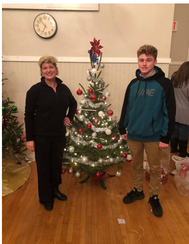
Willington Little League