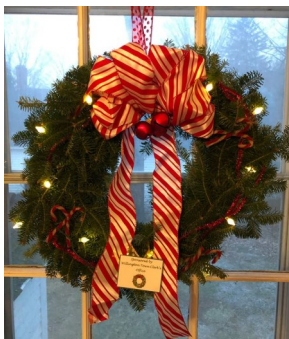
Willington Town Clerk's Office