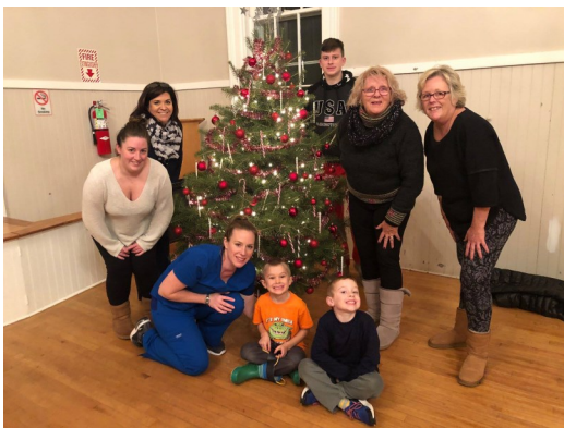
The Wiecenski Family