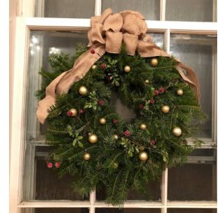
Liam Parsell & Graciela Bourquin