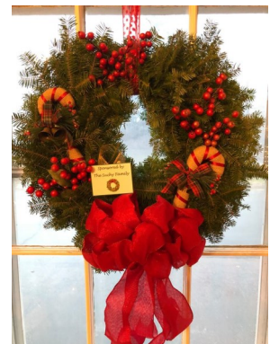
The Suchy Family