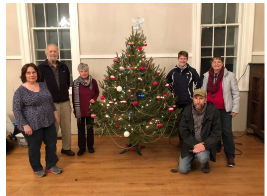
Willington Democratic Town Committee