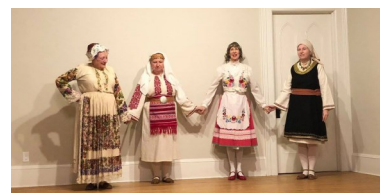
International Folk Dancing Class performing at the Annual Willington Community Tree Lighting