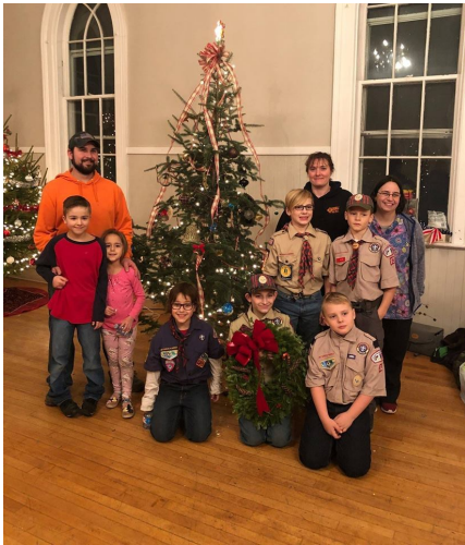
Cub Scout Pack 82

Local Prevention Council Willington Little League