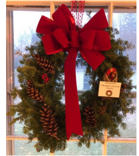
Cub Scout Pack 82