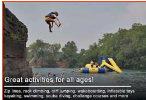
Great activities for all ages!

Zip lines, rock climbing, cliff jumping, wakeboarding, inflatable toys, kayaking, swimming, scuba diving, challenge courses and more