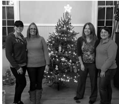
LPC (Local Prevention Council )