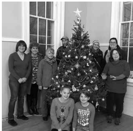
DTC (Willington Democratic Town Committee)